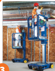
3 ...3.5m working height in 11 seconds.