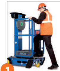
1 Step in.