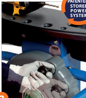
2 Simply turn the handle...